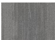
983 Roust About Quickship Available